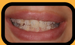
SmileAlign: The Clear Way to a Straighter Smile

Book your consultation with Dr Jas today and take your first step towards a straighter, confident smile with clear ceramic braces.